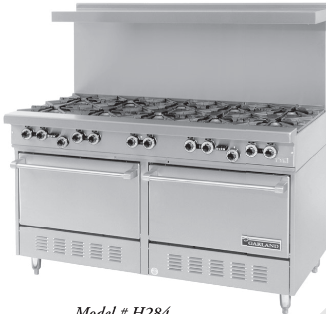
Model # H284